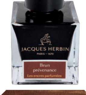
Brown /47JT Smoked honey tea sublimated by