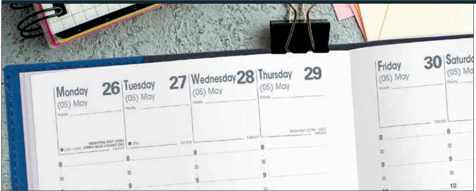
ACADEMIC MINISTER - 6¼ x 9¾" (16 x 24 CM)