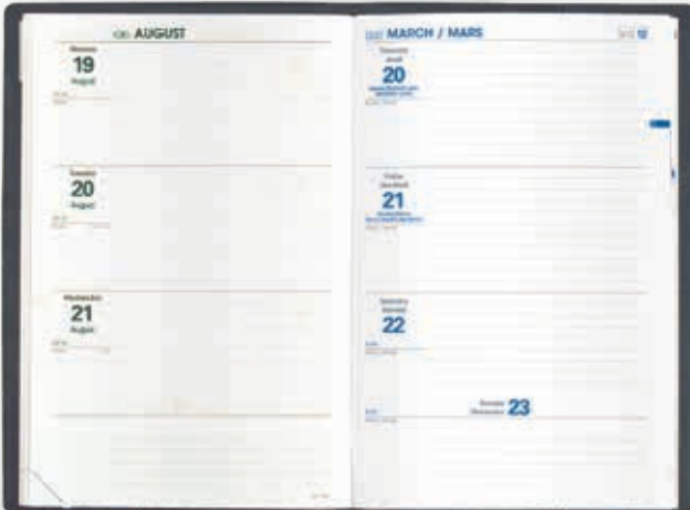
Week on two-pages

HEBDO - 6 1/4 X 9 3/8" (16 X 24 CM) P 12