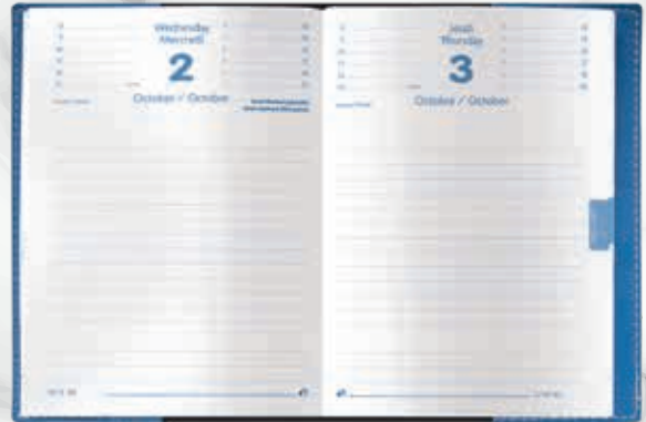
Day per page, Aug. to July

TEXTAGENDA - 4 3/4 X 6 3/4" (12 X 17 CM) P 10