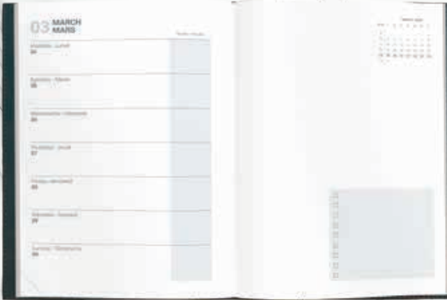
Week on left, notes on right

TEXTAGENDA - 4 3/4 X 6 3/4" (12 X 17 CM) P 10