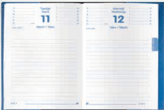
Day per page, Jan. to Dec

NOTOR - 4 3/4 X 6 3/4" (12 X 17 CM) P 10