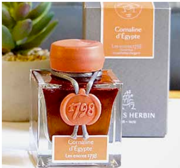
H155/56 - Cornaline d'Egypte

Precaution: Shake bottle well before filling your writing instrument. Frequent cleaning is recommended for maintaining your pen.