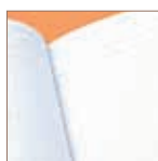
Double ruled margin at the top