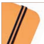
Bicolor elastic closure