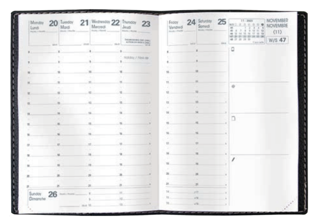
UNIVERSITY - 4" × 6" (10 × 15 cm)

Both the Academic Minister and the University include annual planning pages, daily 8am to 9pm schedules, priority boxes, and space for contacts, but the Academic Minister also features monthly planning pages, three monthly calendars on each spread instead of one, and 90g paper instead of 64g.