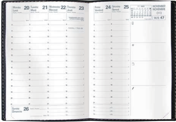
UNIVERSITY - 4" x 6" (10 x 15 cm)

Both the Academic Minister and the University include annual planning pages, daily 8am to 9pm schedules, priority boxes, and space for contacts, but the Academic Minister also features monthly planning pages, three monthly calendars on each spread instead of one, and 90g paper instead of 64g.